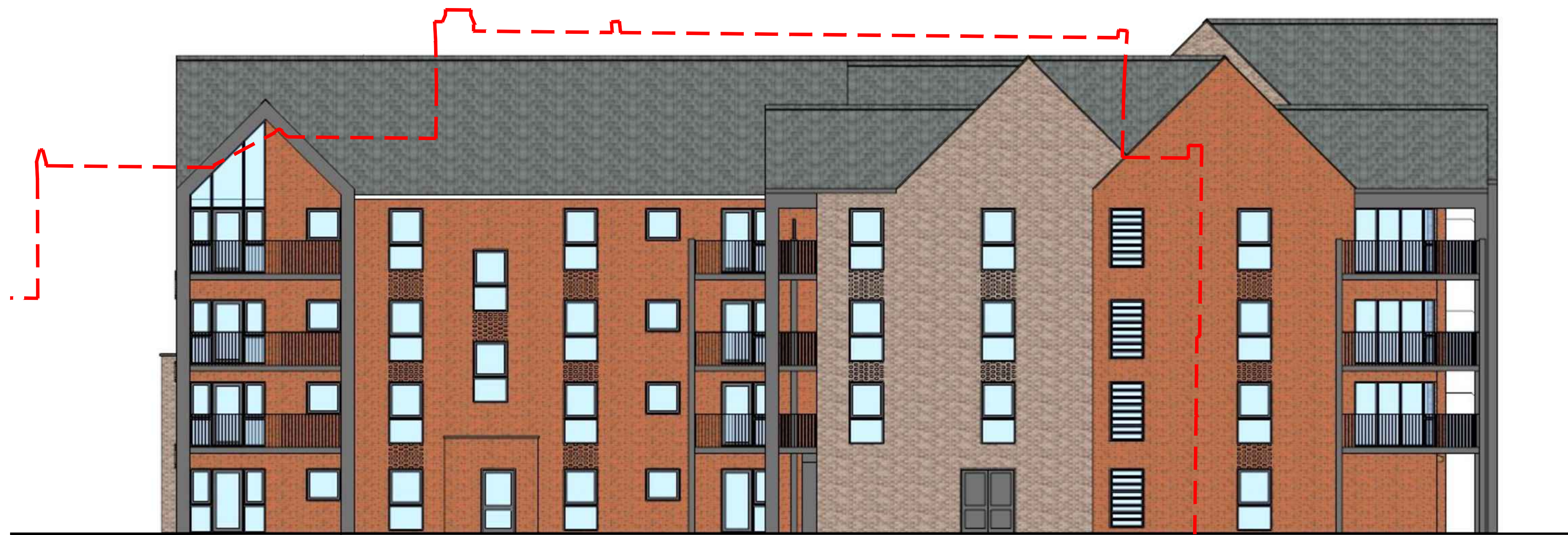
BLOCK A - WEST ELEVATION